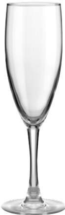
CHAMPAGNE FLUTE ■ Item No. VCV0105 Capacity 150ml Max. Dia. 60mm Height 196mm