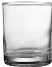
DOUBLE OLD FASHIONED ■

Item No. VCV0303 Capacity 177ml Max. Dia. 63mm Height 85mm