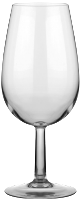
CATAVINOS WINE TASTER