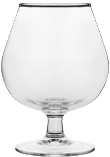
COGNAC / BRANDY