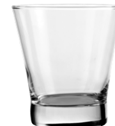
DOUBLE OLD FASHIONED

Item No. VCV0299 Capacity 350ml Max. Dia. 81mm Height 136mm