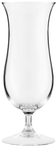
BLUE HAWAII COCKTAIL

A selection of specialist glasses perfect for bars and restaurants. This range of glasses is perfect for fancy cocktails, wine tasting, cognac/brandy, or fine pilsner beers.