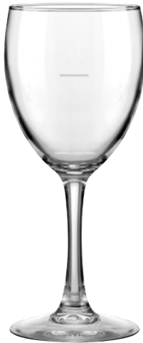
WINE ■ Pour Line at 150ml Item No. VCV0098PL Capacity 310ml Max. Dia. 80mm Height 196mm