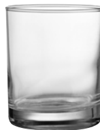
OLD FASHIONED ■

Item No. VCV1042 Capacity 330ml Max. Dia. 79mm Height 94mm