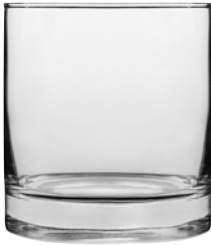
DOUBLE OLD FASHIONED